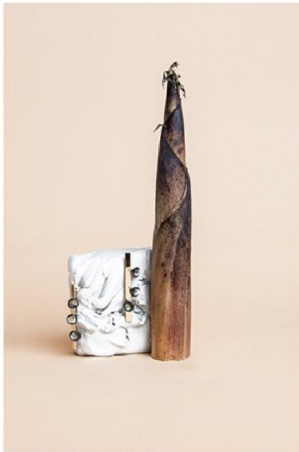
Earrings | LE MADAMADORE | lemadadore.it

Morph Management, 36 Jangmun-ro Yongsan-gu Seoul Korea ZIP 04393 | Phone: +82 2 797 7200